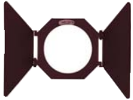
Type 4052 2-Leaf Light Shield