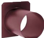
Type 40514 Snoot