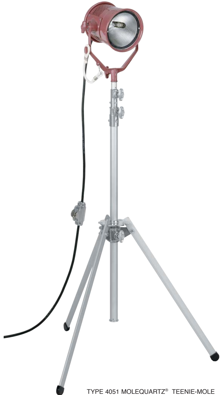
TYPE 4051 MOLEQUARTZ® TEENIE-MOLE MOUNTED ON TYPE 2541 COMPACT LITEWATE BABY SIZE STAND

Compact, focusable tungsten-halogen quartz fixture provides high intensity in a small package. For use in TV news coverage, and TV Film commercials as well as Motion Picture and Industrial films. Excellent for use in small TV studios or stages in schools and universities. Available in Kits for ease in transporting by car, truck, or airplane. Extremely smooth, flat field in all positions from spot-to-flood. Uses special Aluminum Molebrite® Alzak Reflector. For use with 650 watt, 3200°K quartz globe. Equipped with safety screen.