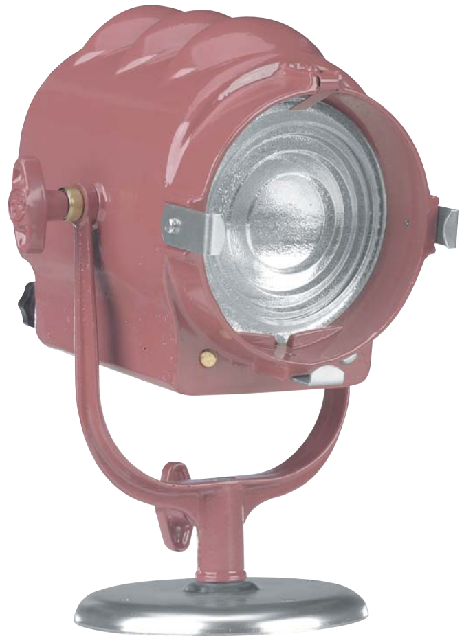
TYPE 2351 MIDGET SOLARSPOT® MOUNTED ON BASE PLATE

A small, rugged Solarspot® that can be focused from spot-to-flood with an even field. Used in the Motion Picture and Television Studios and Still Photography as a key-light, back-light or kicker. Its small size makes the Midget adaptable to mounting on a camera, as a camera light. Quartz Tungsten-Halogen globes are available from 100 to 250 watts. The globe is easily changed by removing the Fresnel Lens.