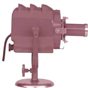
Type 2351 with Type 23541 Focal Spot and Type 280114 Narrow Beam Lens Tube Assembly