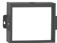
Type 2925 Accessory Holder