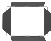
Type 2924 4-Way Light Shield

Globes not included in price of lamp. See price list for complete details.