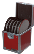
Type 664105 Lens Case (Shown with Lenses, Fresnel & Scrim)