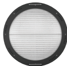
Type 664129 Medium Lens