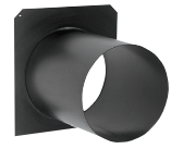
Type 40913 Snoot