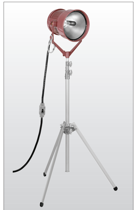
TYPE 4091 MOLEQUARTZ® MIGHTY-MOLE MOUNTED ON TYPE 2541 COMPACT LITEWATE BABY SIZE STAND

Compact, focusable tungsten-halogen quartz fixture provides high intensity in a small package. For use in TV news coverage, and TV Film commercials as well as Motion Picture and Industrial films. Excellent for use in small TV studios or stages in schools and universities. Available in kits for ease in transporting by car, truck, or airplane. Extremely smooth, flat field in all positions from spot-to-flood. Uses special Aluminum Molebrite® Alzak Reflector. For use with 2,000 watt, 3200°K quartz globe. Equipped with safety screen.