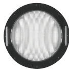
Type 66251 Medium Lens