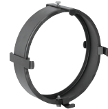
Type 5055 Accessory Holder