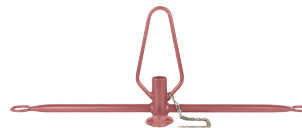
Type 42596 Trapeze