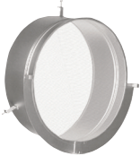
Type 24637 Diffuser Holder with Type 3471 Safety Screen