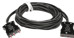
Type 5001301 25 FT. 100 Amp Extension Cable