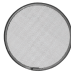
Type 450763D Double Moledura Scrim