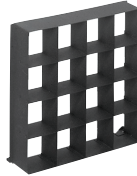
Type 3575 Egg Crate

3575 Egg Crate 25530 Diffuser Frame (18" x 18") 25550 2-Leaf Light Shield 3577 Intensifier 500350 C-Clamp and Adapter 410138 Junior Size Standard Stand (See Stand Section for more information & options)