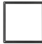
Type 25530 Diffuser Frame