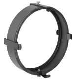
Type 4085 Accessory Holder