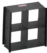
Type 25827 Egg Crate

Globes are not included in price of lamp. See price list for complete details.