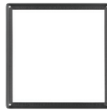
Type 25830 Diffuser Frame