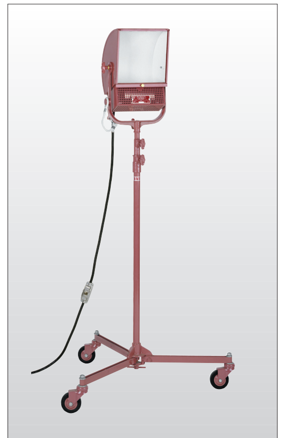
TYPE 2581 MOLEQUARTZ® BABY SOFTLIGHT MOUNTED ON TYPE 40651A BABY SIZE STANDARD STAND

Provides soft, diffused virtually shadowless light with smooth field. Can be mounted on Television or Motion Picture camera as fill-light. Used for soft fill in Still, Commercial and Motion Picture Photography and Television Studios. Designed so that all the light comes indirect and unobstructed from diffuse surfaces through a relatively large aperture. Uses 1,000 watt 3200°K quartz globe. Equipped with safety screen.