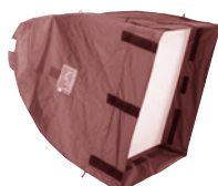
Type 8110 Chimera Pro Bank (xSmall)