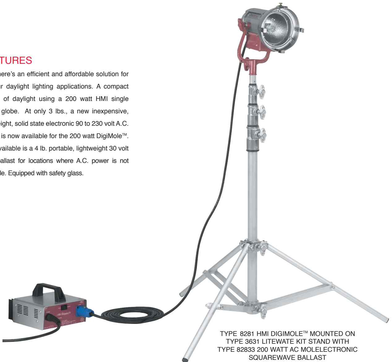
TYPE 8281 HMI DIGIMOLE™ MOUNTED ON TYPE 3631 LITEWATE KIT STAND WITH TYPE 82833 200 WATT AC MOLELECTRONIC SQUAREWAVE BALLAST

Now there's an efficient and affordable solution for all your daylight lighting applications. A compact source of daylight using a 200 watt HMI single ended globe. At only 3 lbs., a new inexpensive, lightweight, solid state electronic 90 to 230 volt A.C. ballast is now available for the 200 watt DigiMole™. Also available is a 4 lb. portable, lightweight 30 volt D.C. ballast for locations where A.C. power is not available. Equipped with safety glass.