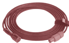
Type 82852 Head Extension Cable 15 ft.