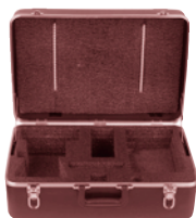
Type 58114 Moleded Case