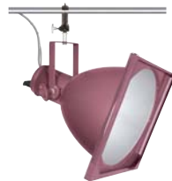
Type 8181 Molequartz® 18" Fixed Focus Scoop with accessory Type 8185 Square Diffuser Holder suspended by accessory Type 81852 C-Clamp and Adapter