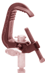
Type 81852 C-Clamp & Adapter with 1/2-13 Hex Head Capscrew