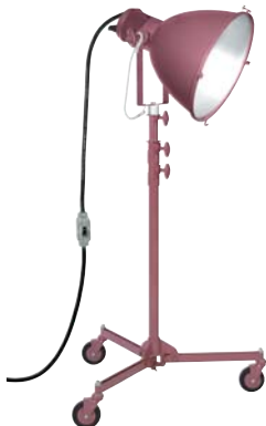
Type 8182 Molequartz® 18" Fixed Focus Scoop with Type 81885 Diffuser Clip Ring, accessory Type 8183 Yoke Yoke Pin and special 25 foot cable, mounted on Type 410138 Junior Size Standard Stand

TYPE 8181 MOLEQUARTZ® 18" FIXED FOCUS SCOOP WITH TYPE 81885 DIFFUSER CLIP RING SUSPENDED BY ACCESSORY TYPE 81852 C-CLAMP AND ADAPTER WITH 1/2 -13 HEX HEAD CAPSCREW