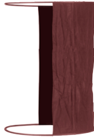
Type 72977 Half Black Skirt (64" length)