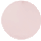
Type 72937 Silk Target