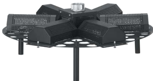
The 6,000 Watt Spacelite is equipped with legs, making for easy stacking of units for storage.

The New Type 7291 6,000 Watt Spacelite brings to the Motion Picture Industry a more diversified lantern light. With the addition of a 6 circuit socapex connector, this unit can be powered and controlled with the existing socapex multi-circuit control system. There are 2 and 3 circuit adapters available or attach a socapex cable and have 6 circuits of control. This lantern light with the black and internal silk can reflect a pool of light downward or just remove the outside black skirt for a full lantern effect. Each globe set is equipped with a safety screen.