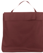
Type G12100 Skirt Bag