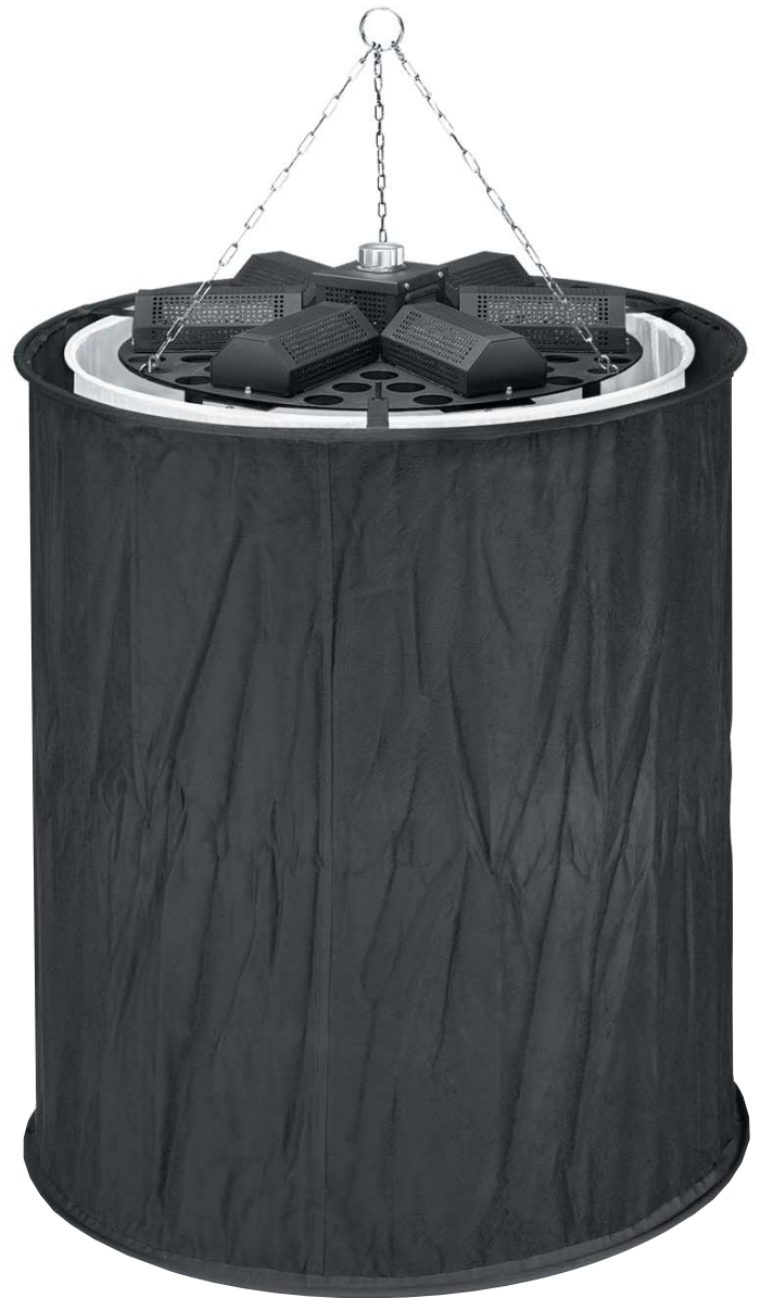
TYPE 7291 SPACELITE® WITH TYPE 72936 WHITE SKIRT & TYPE 72935 BLACK SKIRT