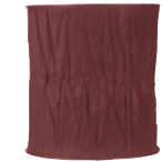
Type 72935 Black Skirt

Globes not included in price of lamp. See price list for complete details.