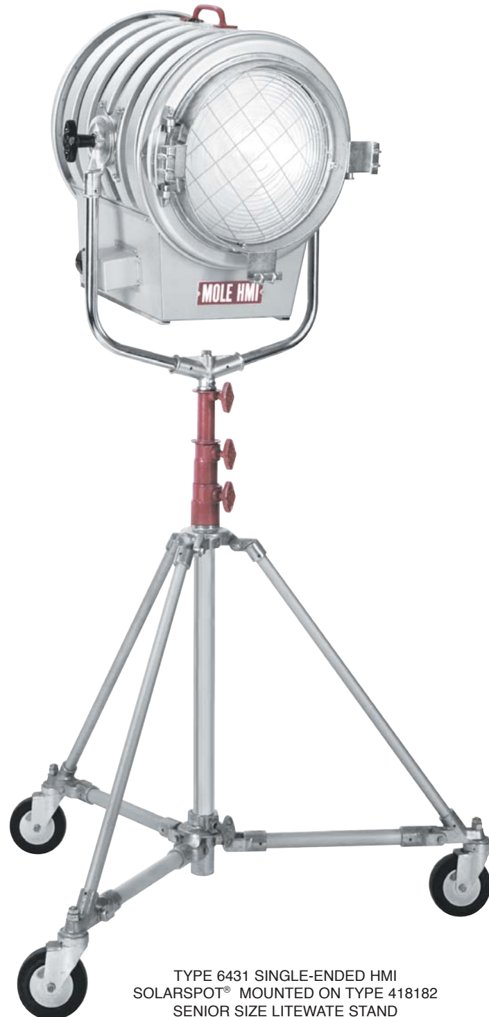
TYPE 6431 SINGLE-ENDED HMI SOLARSPOT® MOUNTED ON TYPE 418182 SENIOR SIZE LITEWATE STAND

Designed around the new 6,000 watt single-end HMI globe. This HMI Solarspot® produces high light output at low amperage with a smooth even field from spot to flood. The lightweight, circular ventilated housing makes it unsurpassed for film locations, television remotes and news coverage. Especially useful in any interior where daylight color balance is required. Equipped with a safety screen.