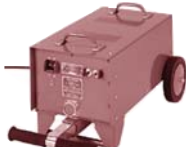
Type 6165 Standard Magnetic Ballast