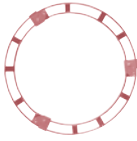
Type 418105 Molering Diffuser Frame