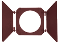
Type 4132 2-Way Barn Door