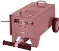
Type 6155 Standard Magnetic Ballast