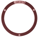
Type 4133 Moledisc Diffuser Frame