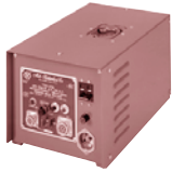
Type 6158 575W/1,200W Electronic Square Wave AC/DC Ballast