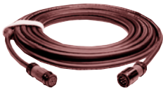
Type 63242 50 ft. Head Cable