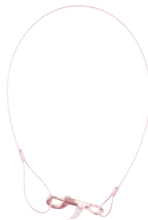
Type 81861 Safety Cable