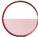
Type 4138D Half Double Moledura Scrim