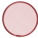
Type 419109D Moledura Scrim