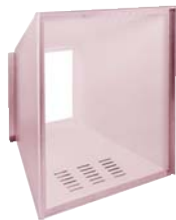
Type 418348 Molecone