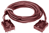
Type 5001301 25' 100 Amp Extension Cable