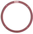
Type 419103 Moledisc Diffuser Frame