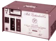
Type 42590 10K A.C. Dimmer