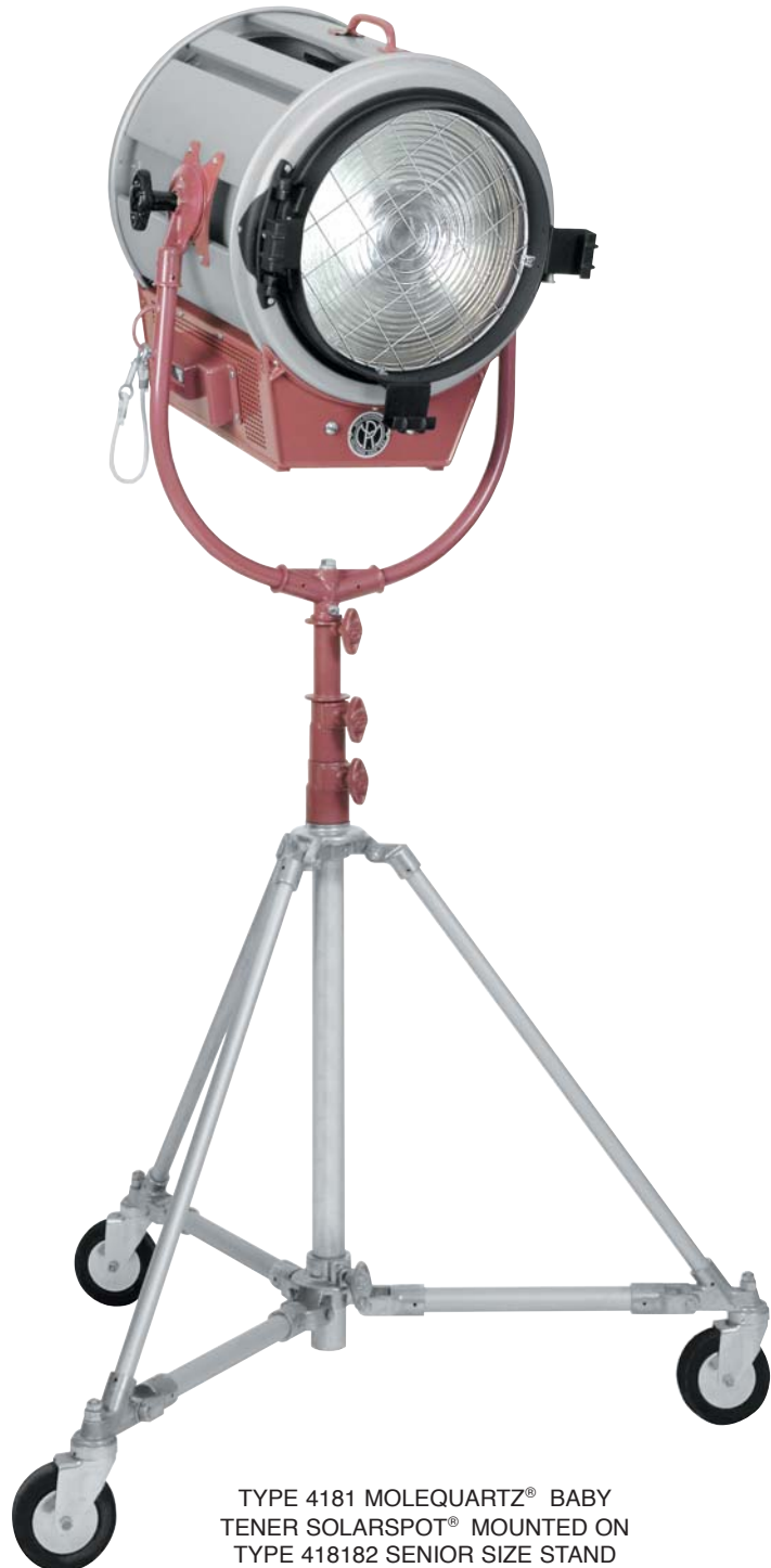
TYPE 4181 MOLEQUARTZ® BABY TENER SOLARSPOT® MOUNTED ON TYPE 418182 SENIOR SIZE STAND

Designed for Quartz Tungsten-Halogen globes. More compact and lightweight aluminum housing with high performance. 14" Fresnel condenser mounted in front opening door. Choice of Fresnel condenser: Hot Lens (narrow angle) or Cold Lens (wide angle). Accessories fit in wide diffuser clips on front door with no light obstruction. Crank handle on rear for focusing. Molecool® locking knob on yoke. Equipped with safety screen.