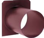
Type 40866 Snoot