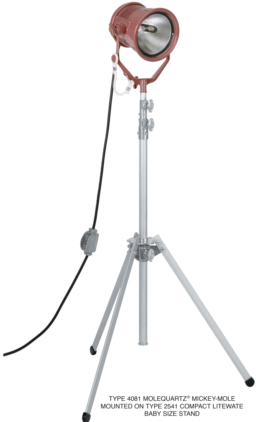
TYPE 4081 MOLEQUARTZ® MICKEY-MOLE MOUNTED ON TYPE 2541 COMPACT LITEWATE BABY SIZE STAND

Compact, focusable tungsten-halogen quartz fixture provides high intensity in a small package. For use in TV news coverage, and TV Film commercials as well as Motion Picture and Industrial films. Excellent for use in small TV studios or stages in schools and universities. Available in kits for ease in transporting by car, truck, or airplane. Extremely smooth, flat field in all positions from spot-to-flood. Uses special Aluminum Molebrite® Alzak Reflector. For use with 1,000 watt, 3200°K quartz globe. Equipped with safety screen.