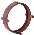
Type 4085 Accessory Holder