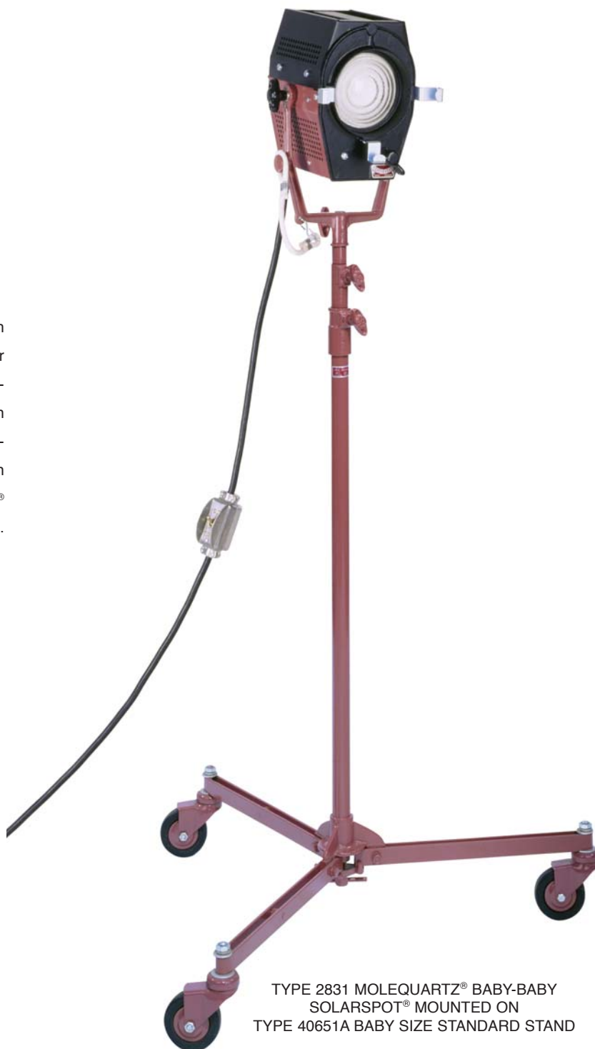
TYPE 2831 MOLEQUARTZ® BABY-BABY SOLARSPOT® MOUNTED ON TYPE 40651A BABY SIZE STANDARD STAND

A compact and lightweight Solarspot® with high performance. 4 15/32 " Fresnel Condenser mounted in front casting. For use as a key-light, back-light or kicker with a smooth even field from spot-to-flood. Ideal for use on hangers, trombones, wall sleds and wall plates on Motion Picture and Television Sets. Molecool® Paddles on front and rear for quick focusing. Top swings back for easy access to globe.