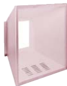
Type 283161 Molecone