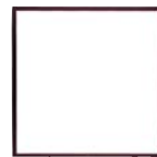
Type 412157 Diffuser Frame