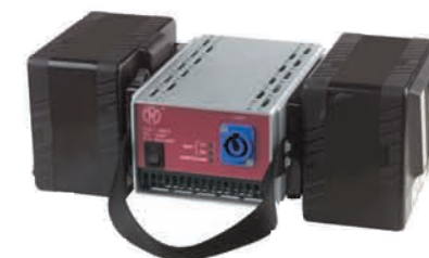
Type 82865 with On-Board Batteries