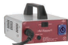
Type 82833 200W AC Ballast