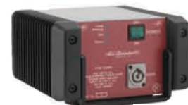
Type 82926 400W AC Ballast