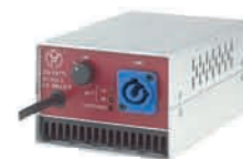
Type 82850 30V DC Ballast